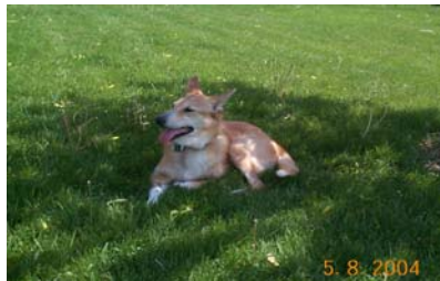
Trixie in May 2004